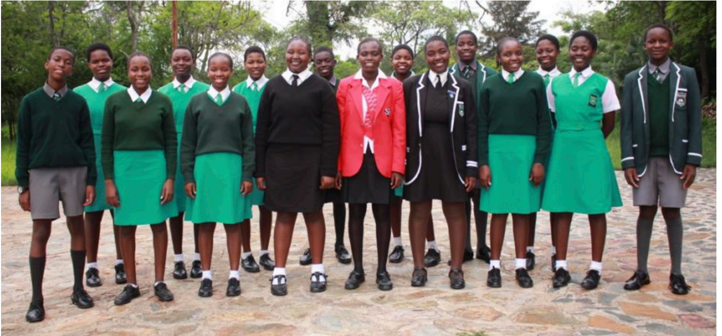
Part of the 53 scholarship recipients

Our scholarship fund gives many poor and marginalised pupils a chance to be properly schooled. Selected children are assisted from junior school right up to college or university. A total of 53 pupils and students benefited from the scholarship fund. Of these, 13 are at junior school, 34 at senior school and 6 at college or university.