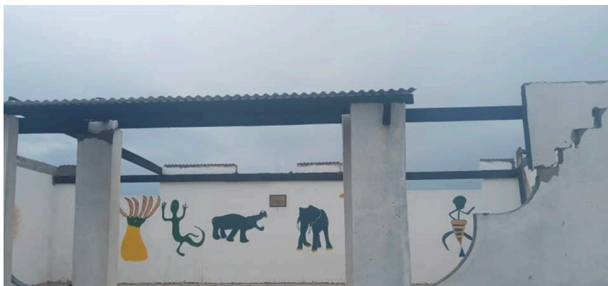
The storm damaged the roof and the walls

On the 22nd November, there was a huge hailstorm in the Hope Fountain area. One of our pre-schools, Sethule Hope Centre, located in that area, was affected. During this incident, the roof was blown completely off by the wind. Fortunately, no injuries were recorded. The walls of the building were left rather unstable and the building was no longer safe for use. Below are the photos of the affected building. It is currently being re-built.