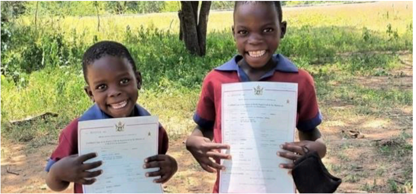
Children happy to own a birth certificate