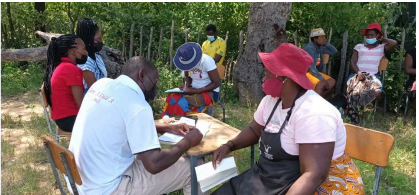
Data collection for birth registration