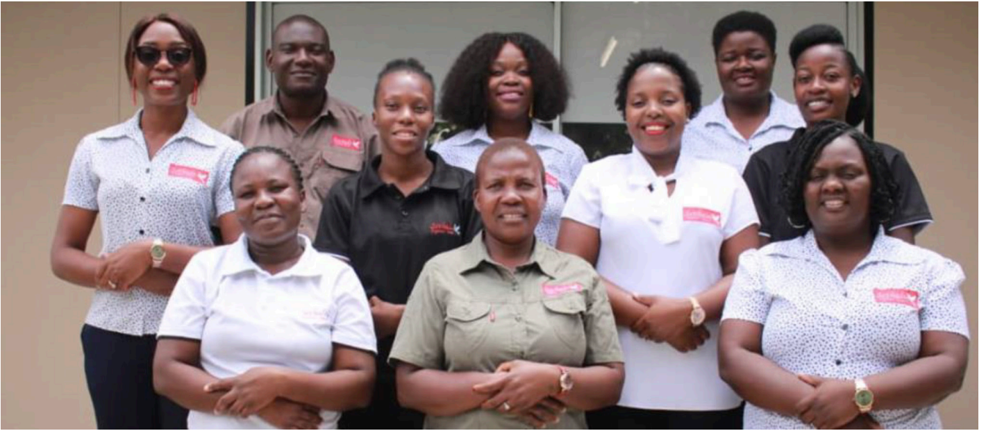
Part of the Sethule Staff members