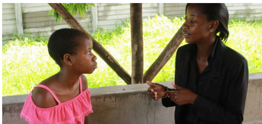
Child receiving mental health counselling