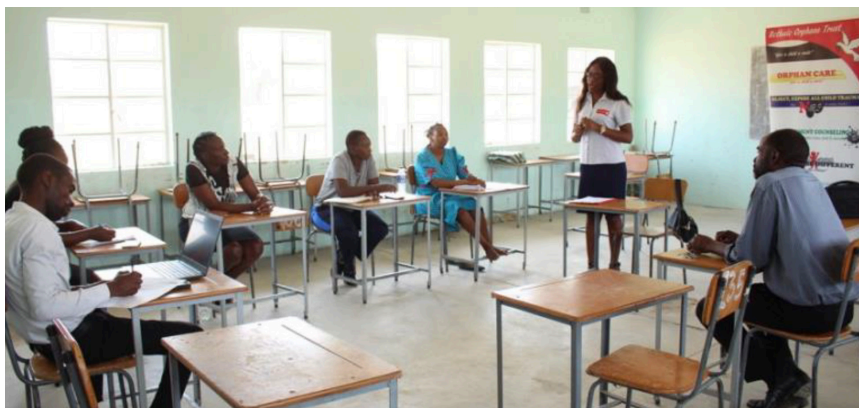
Teachers at a child safeguarding workshop

These workshops enable the pupils/students to be vigilant in ways of interacting and recognizing the signs of abuse with their peers, parents, visitors and teachers. This year in 2022, the Sethule Safeguarding team reached out to 346 pupils/students and 70 Adults (teachers & parents).