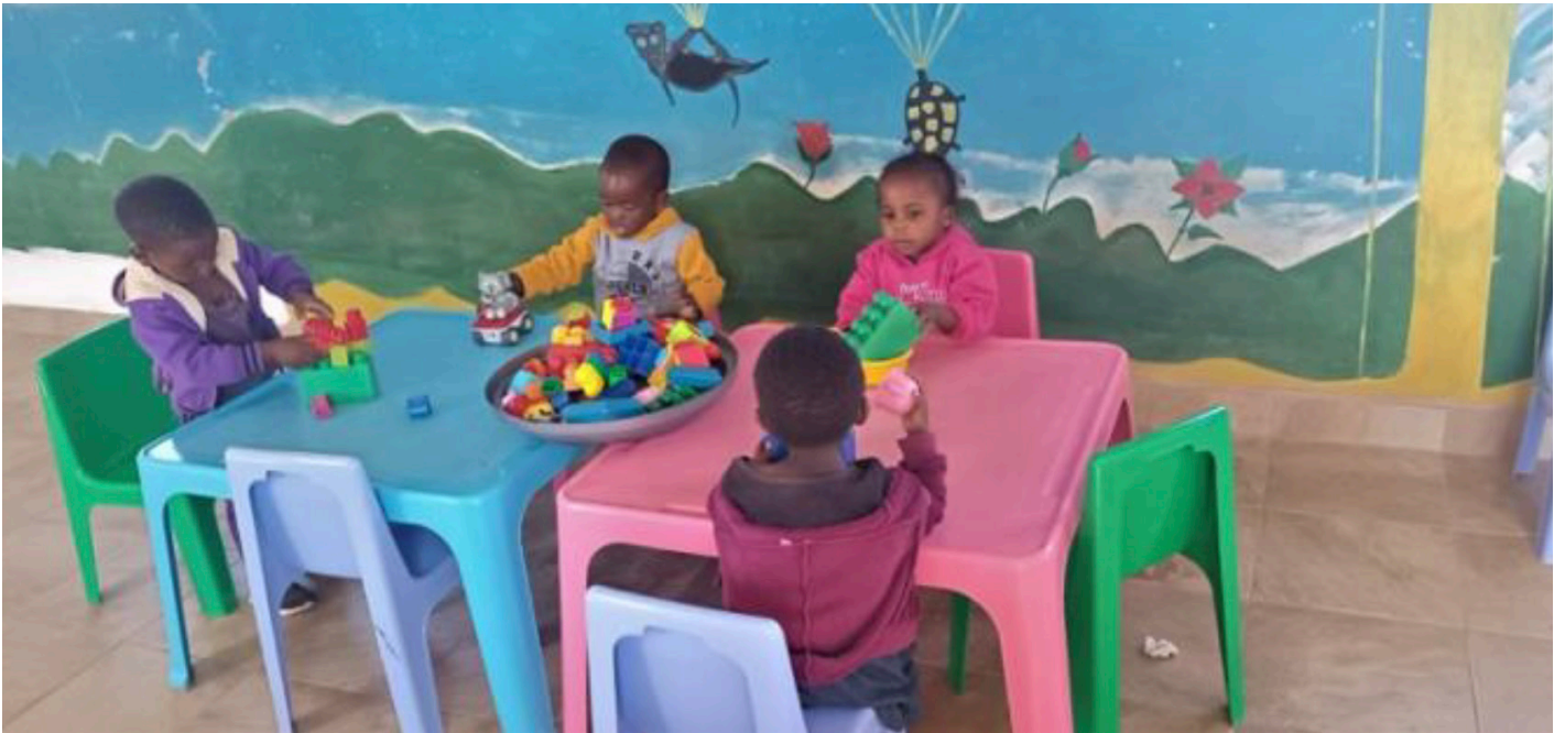
Children playing at the Sethule Hope centre.

The Sethule Hope centre gives children between the ages 3 to 5 years, “a chance to learn & play”. Owing to COVID19 restrictions, it was closed in 2021. This however gave us an opportunity to renovate the centre as well as install more equipment in the play area.