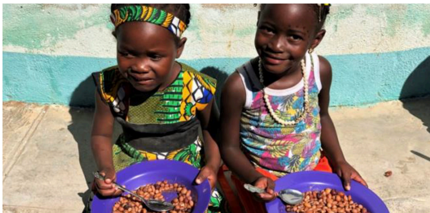
Girls eating traditional food during the Africa Day celebration

Emarika ECD honours and celebrates some national events. The celebration Africa day was enjoyed by both children and parents. A variety of African cuisines were prepared. In December, we said goodbye to 21 pupils who will be starting junior school in January 2023.