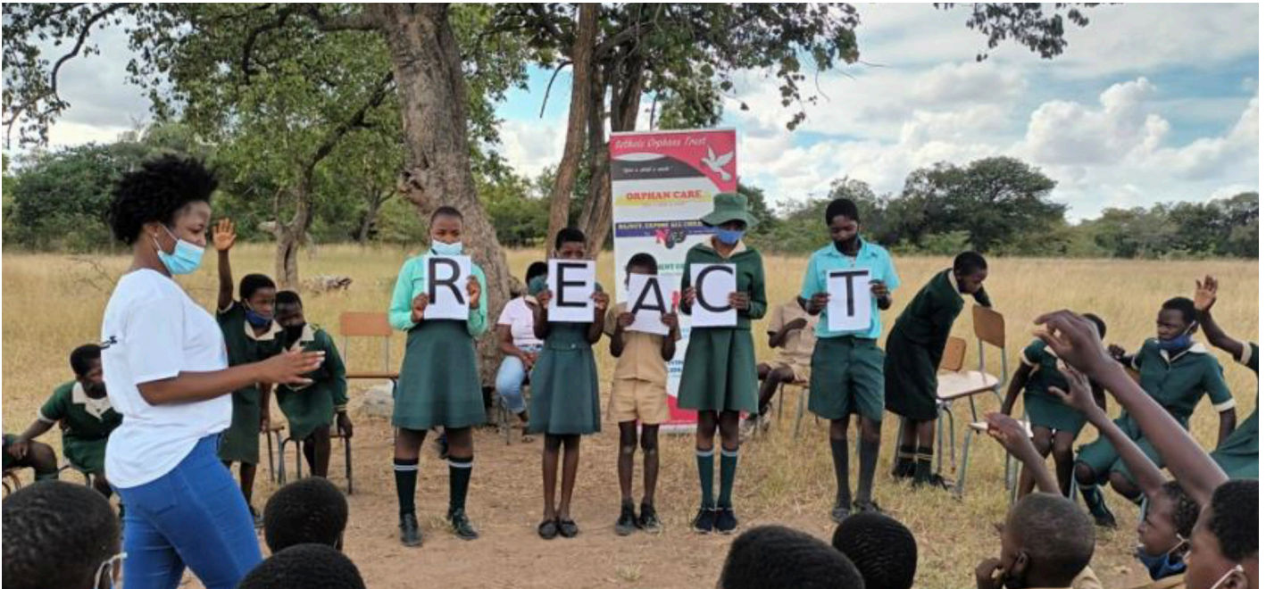
Children as a REACT session